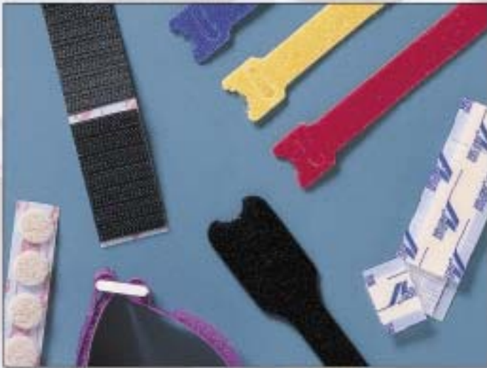
The Velcro Companies offer global fabricating & converting capabilities.

A full range of design, engineering and application services are also available from the Velcro companies, including adhesive/substrate testing and closure system recommendations.